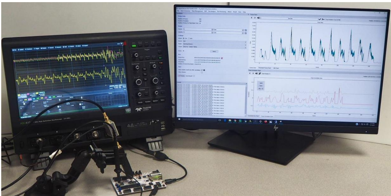
Fig. 2: An FPGA prototype SCA evaluation using our SCA evaluation platform